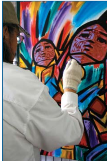
Artist creating art at Aboriginal Day 2007, Vancouver