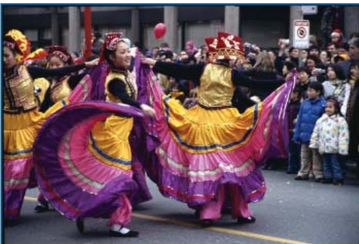
Chinese New Year Parade. Vancouver has the 2nd largest Chinatown in North America, after San Francisco