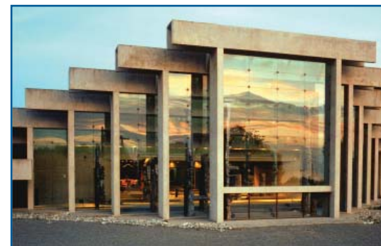
Museum of Anthropology, site of one of ILA’s preconference excursions