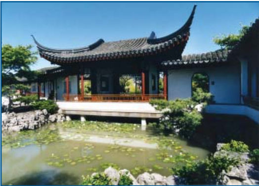
Dr. Sun Yat Sen Garden: a traditional Chinese garden in downtown Vancouver